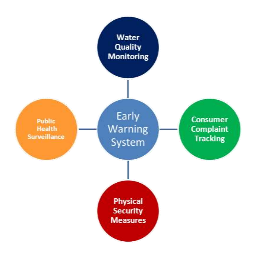
Figure 2: Design Features of an Early Warning System (EWS) Model

and could estimate concentration of the contaminant in the drinking water distribution system.