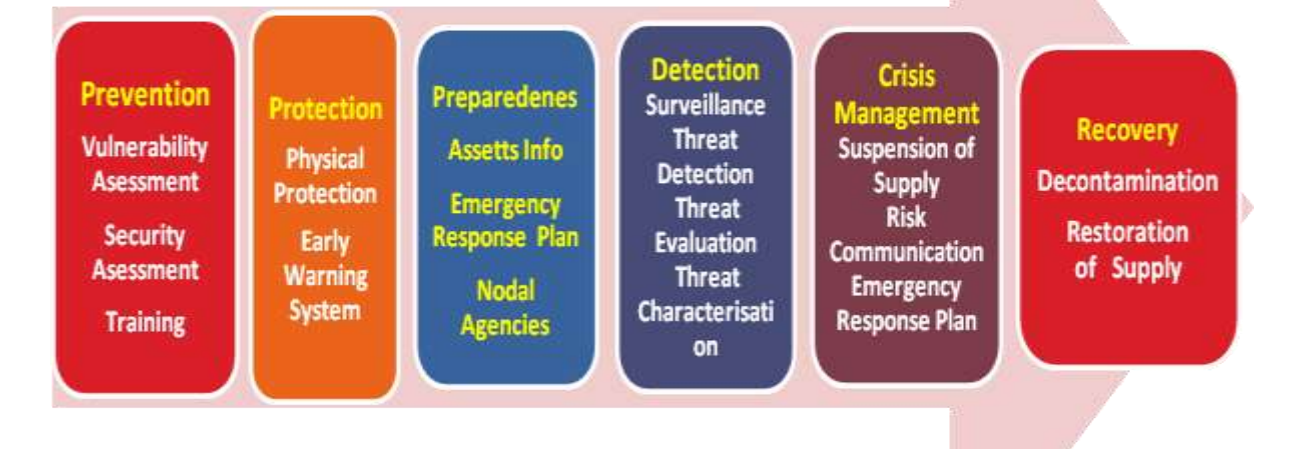
Figure 1: Flow Chart of Operation

contamination should primarily focus on mitigation measures including physical protection of water facilities, proper sensitization and training of personnel, procurement of emergency logistics and institutionalization of periodic security check measures.